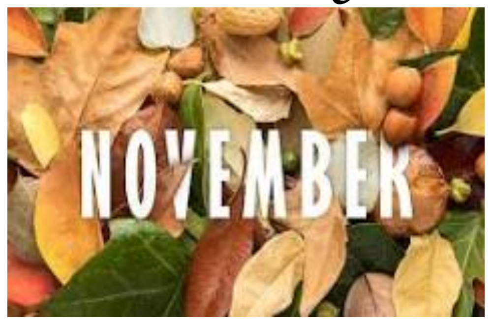
Holy Innocents Church Gt. Barton Newsletter

Our on-line magazine can be found on our website: <a href="http://themessengergtbarton.suffolk.cloud">http://themessengergtbarton.suffolk.cloud</a>