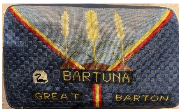
The History of Knockers